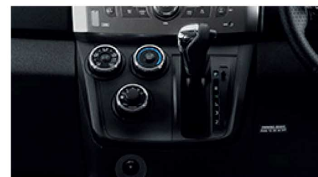
Gear shift with lock (A/T only)