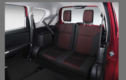
3rd Row Seat