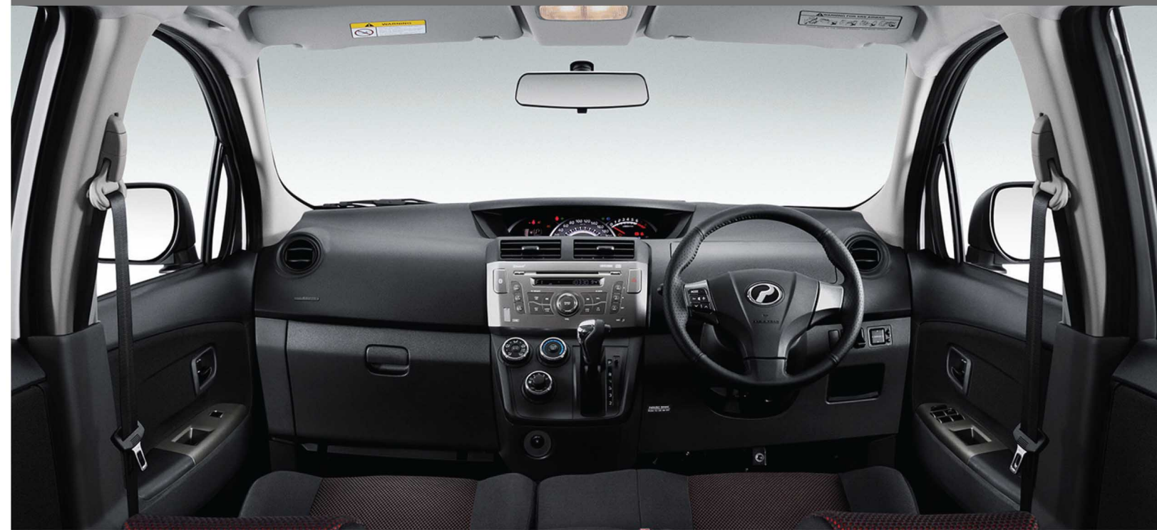
Monotone black interior, Gear shift lever with shift lock | Steering wheel with audio switches.