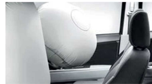
Dual SRS Airbags