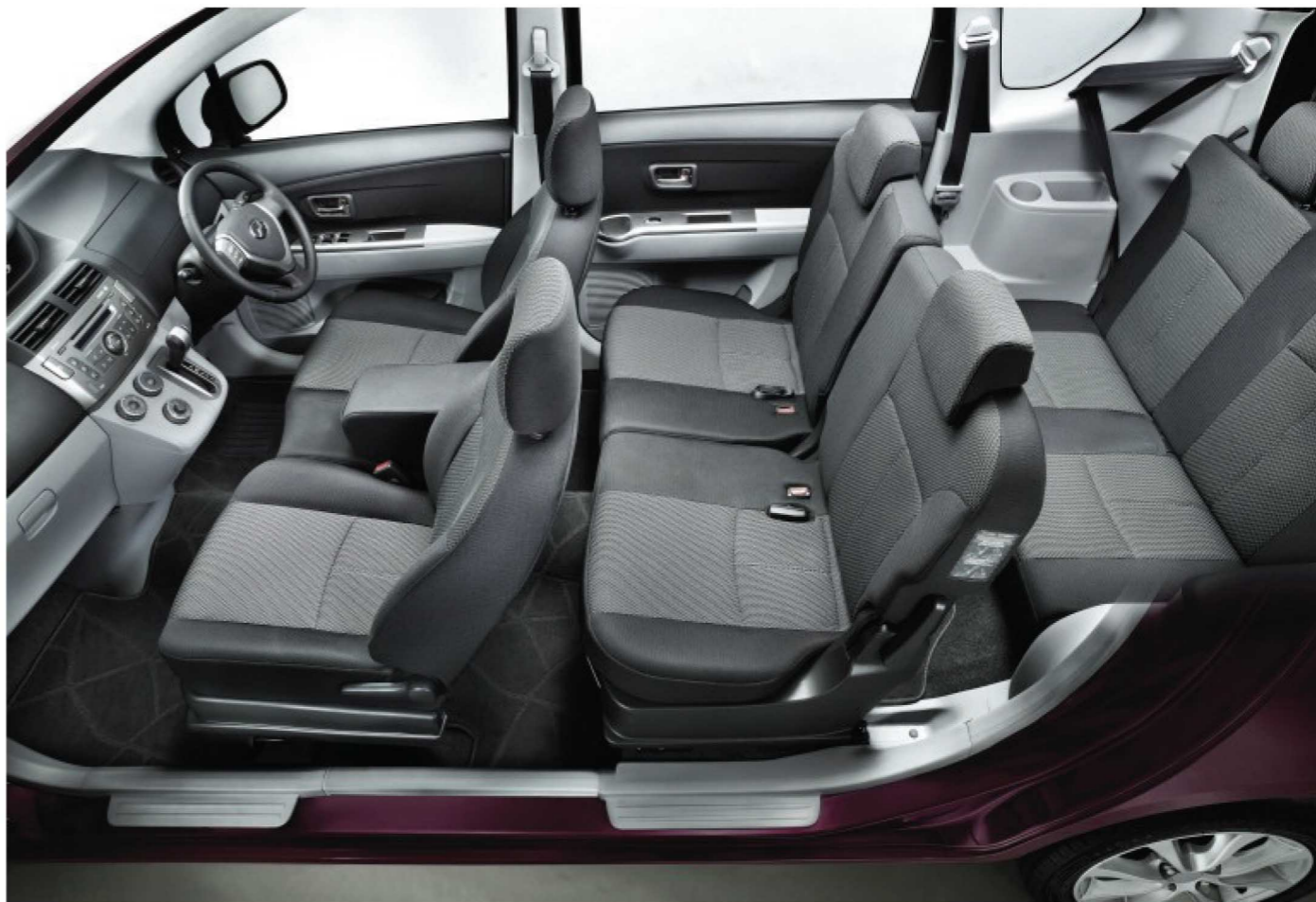
Seat Height Adjuster (Driver Side)