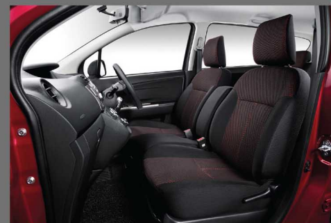
1st Row Seat