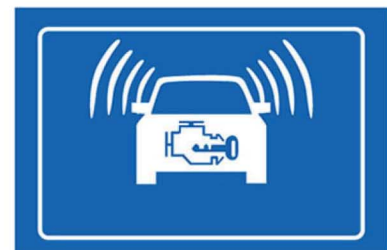
Immobiliser anti-theft system