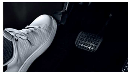
Foot parking brake (A/T only)