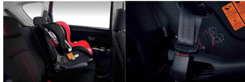
ISOFIX child safety system