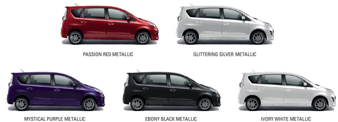
PASSION RED METALLIC