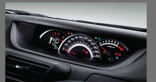
New Meter Design