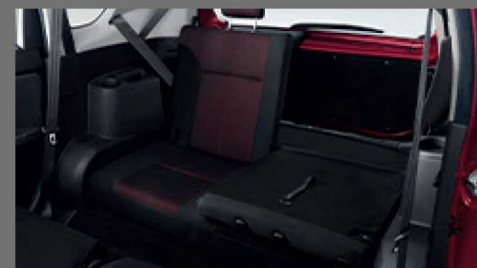
Split Folding 3rd Row Seat