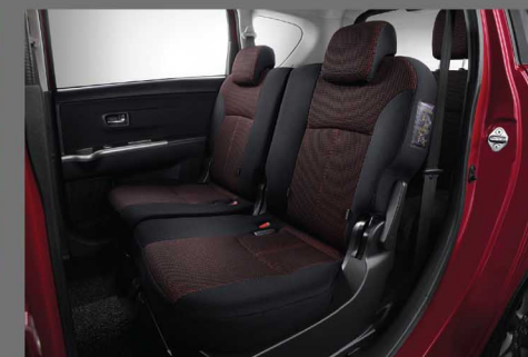
2nd Row Seat