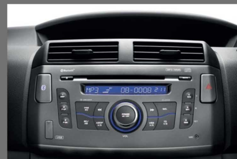
Radio CD-player with MP3/WMA, USB & Bluetooth