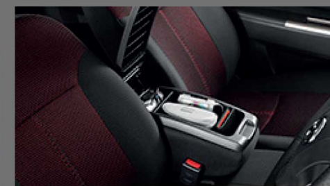
Armrest With Storage Compartment [A/T Only]